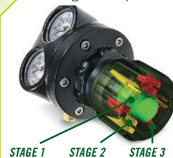
SHOCK ABSORBING KNOB