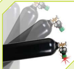
SINGLE IMPACT POINT