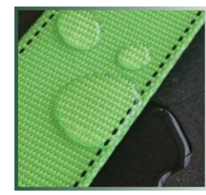
Vinyl-coated webbing prevents absorption of liquids and is easy to clean.

Food Processing Petrochemical Water Treatment Painting Billboards General Industry