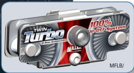
Twin Turbo D-Ring Connector

An effective solution when working with low fall clearance