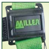
Self-contained label pack