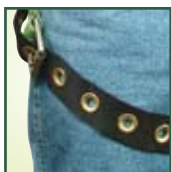
Tongue buckle leg straps