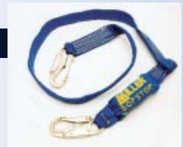
Model 913K (Model 940K available for 12 ft. free fall)