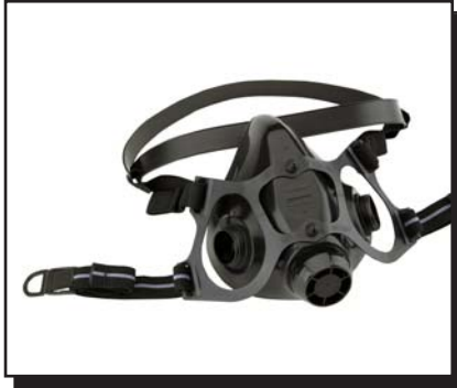
North 7700 Series Half Mask "The industry standard"