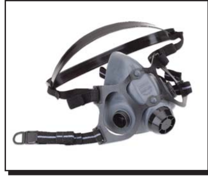
North 5500 Series Half Mask "The economical alternative"