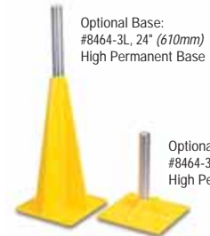
Optional Base: #8464-3L, 24" (610mm) High Permanent Base