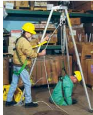
A secondary fall arrest system is recommended.

*Rope length is divided by four to determine maximum working length.