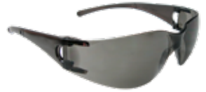
GAFA LITE LENTE GRIS SIN AF