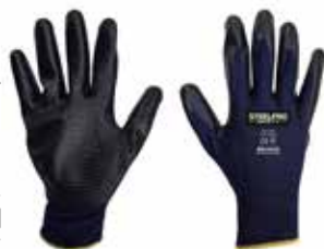
GUANTES MULTIFLEX POLIESTER NITRILLO