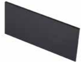
VIDRIO OSCURO PARA MASCARA DE SOLDAR