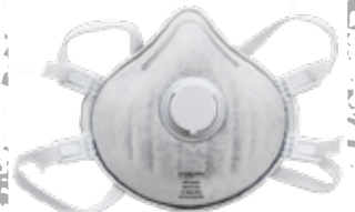
RESPIRADOR M933VOV VAPORES ORGANICOS N95