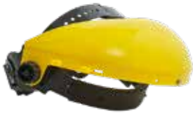
CASQUETE PORTA/VISOR RACHET