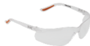
GAFA NEON LENTE CLARO ANTI FOG