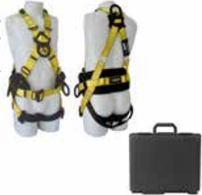
ARNES MULTIPROPOSITO DIELECTRICO 6 ARGOLLAS CON FAJA CON MALETA