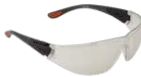
GAFAS RUNNER AF LENTE IN-OUT