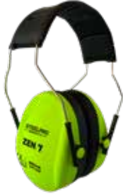
FONO ZEN7 DIADEMA NRR24DB/ SNR29DB