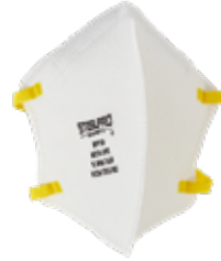
RESPIRADOR PLEGABLE M9910 N95