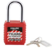
CANDADO GRILLETE CORTO ACERO