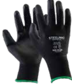
GUANTE MULTIFLEX NYLON PU