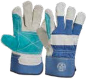
DESCONT GUANTES CARNAZA LONA REFORZADO II