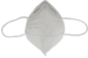
RESPIRADOR KN95 DESCARTABLE