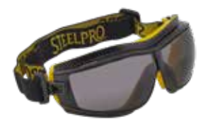
MONOGAFAS ZEX ANTI FOG GRIS