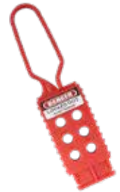
DISPOSITIVO BLOQUEO MÚLTIPLE 6 CANDADOS - ÁREAS CLASIFICADAS