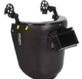
CARETA PARA SOLDAR ADAPTABLE A CASCO