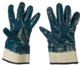
GUANTES NITRILSAFE RUGOSO PUÑO DE SEGURIDAD