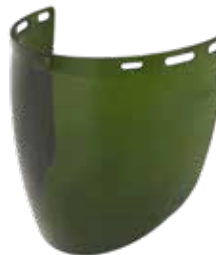
VISOR POLICARBONATO IR 3.0 ROCKET