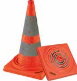
CONO REFLECTANTE REPLEGABLE 28