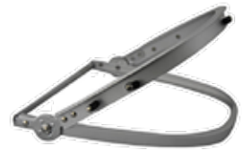
BASCULANTE ALTAS TEMPERATURAS ROCKET