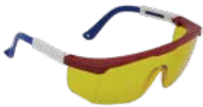
GAFAS TOP GUN LENTE AMBAR ANTI FOG