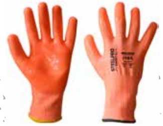
MULTIFLEX CUT-5 SILICONE NARANJA HV