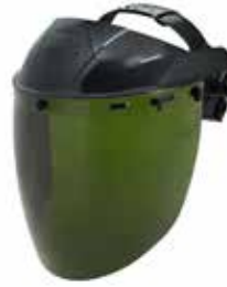
CARETA VISOR POLICARBONATO IR 3.0 ROCKET