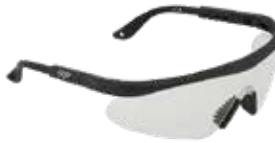
GAFA DEMON LENTE CLARO ANTI FOG