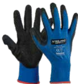
GUANTES MULTIFLEX POLIESTER LATEX