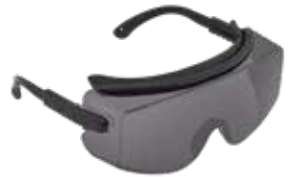
DESCONT GAFAS TOP GUN OPTICO ANTI FOG LENTE OSCURO