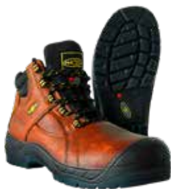
BOTA CUERO HIDROFUGADO TUCSON CAFÉ