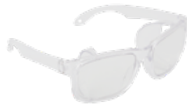
GAFA WOLF CLARO AF 2.0 CON CORDÓN Y BOLSA TRANSPORTE