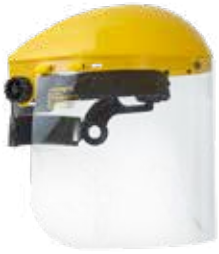
CARETA ESMERILAR RACHET SIN RIBETE COMPLETA