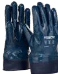
GUANTE NITRILSAFE CUT