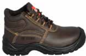
BOTA EN CUERO GRASO MARRÓN FULLRISK 804 ANTIPUNCIÓN