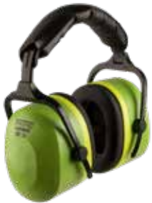
PROTECTOR AUDITIVO COPA JUMBO 33 DB