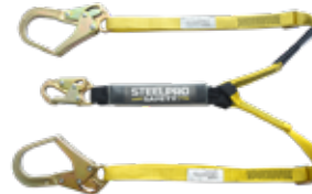
ESLINGA Y ABSORBEDOR MOSQUETON 2 1/4