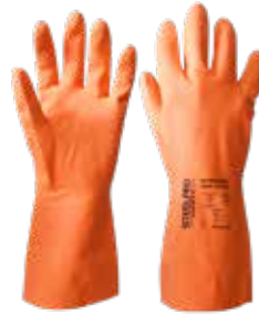
GUANTES ULTRASAFE NEO-LATEX 28MIL 13"