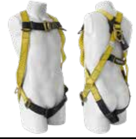
ARNES EN H MULTIPROPOSITO 4 ARGOLLAS ECO