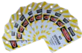
TARJETAS LOTO AMARILLO X 10 PLÁSTICA - BRIDA/OJAL PLÁSTICO 75X146MM/PQ 10UND