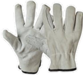
GUANTE CARNAZA STANDARD