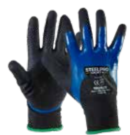
GUANTES MULTIFLEX SANDY EXTRA NITRILO