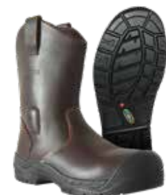
BOTA CAÑA ALTA PETROLERA CAFÉ