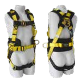
CONFINADOS 6 ARGOLLAS EN H CONSTRUCCION