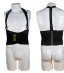
FAJA LUMBAR ERGONOMICA PROFESIONAL