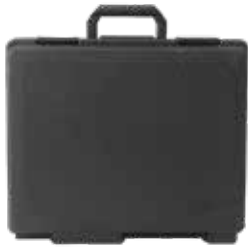
MALETA PLASTICA KIT DE ALTURAS - RESISTENTE