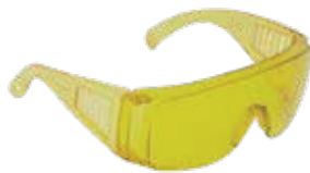
GAFAS PERSONA L.AMBAR ANTI FOG