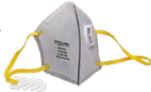
RESPIRADOR PLEGABLE M9910V CARBON ACTIVADO N95