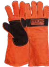
GUANTE SOLDADOR NARANJA/NEGRO