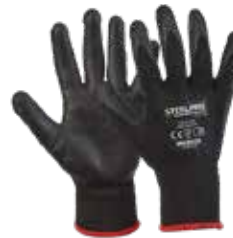
GUANTES MULTIFLEX LATEX ECO NEGRO