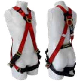
ARNES CUERPO COMPLETO ECO EN X ROJO