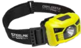
LINTERNA SENSOR X