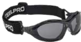
GAFA X5 LENTE GRIS