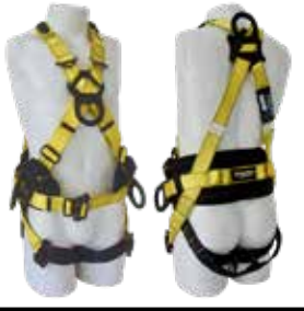
ARNES EN X DIELECTRICO MULTIPROPOSITO CON FAJA 4 ARGOLLAS