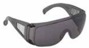
GAFAS PERSONA LENTE GRIS ANTI FOG