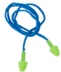
PROTECTOR AUDITIVO PVC REFLEX BOLSA 26DB