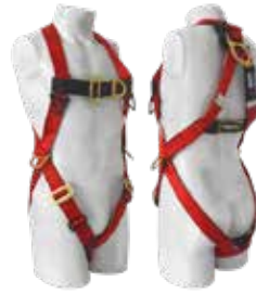
ARNES MULTIPROPOSITO 4 ARGOLLA O H ROJO STEELPRO