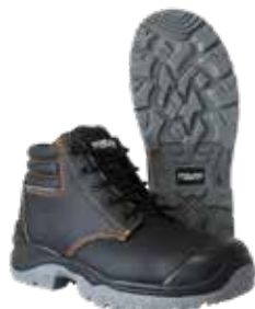
BOTA DIELECTRICA COOPER NEGRA