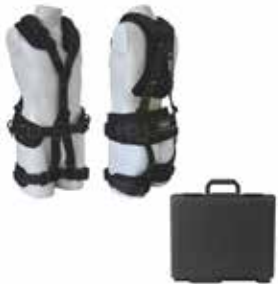
ARNES RESCATE INDUSTRIAL 7 ARGOLLAS CON MALETA