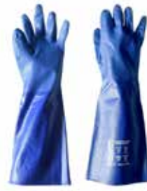
GUANTES NITRILSAFE THERM 18 SOPORTADO