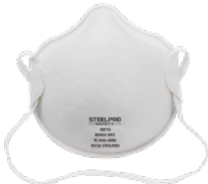
RESPIRADOR M910 N95