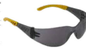
GAFA SPY FLEX.LENTE GRIS ANTI FOG