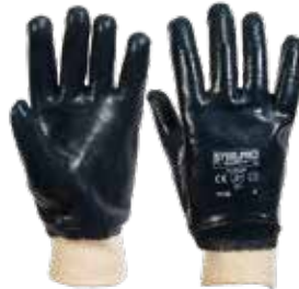
GUANTES NITRILSAFE LISO PUÑO TFKB