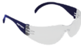
GAFA MAX210 LUNA CLARO