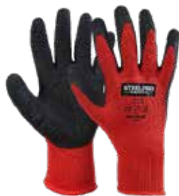
GUANTES MULTIFLEX LATEX ROJO