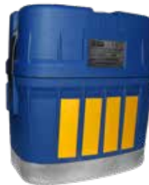
EQUIPO AUTORESCATADOR DE 30 MINUTOS