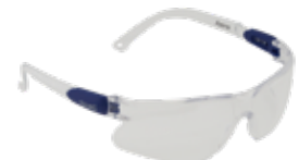
GAFA AERO LENTE CLARO ANTI FOG