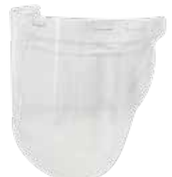
VISOR CLARO AF MENTONERA ROCKET