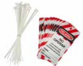
PACK TARJETAS NO OPERAR LOCK OUT X 25 UND +AMARRE PLÁSTICO