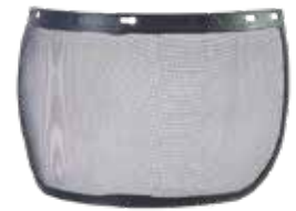
VISOR MALLA TRABAJOS FORESTALES