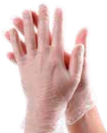
GUANTES ELASTOSAFE VINILO TALLA S CJX100