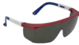
GAFAS TOP GUN INFRARED IR.5 ANTI FOG