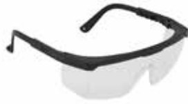
GAFA NITRO LENTE CLARO