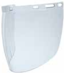
VISOR POLICARBONATO CLARO ROCKET