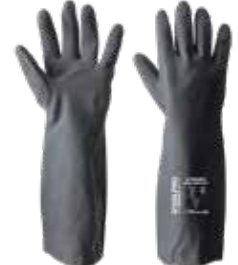
GUANTES ULTRASAFE DEFENDER 18"