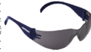
GAFA MAX210 LUNA OSCURO