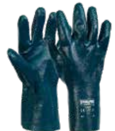
GUANTES NITRILSAFE 13 RECUBIERTO