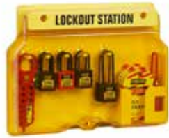
ESTACIÓN BLOQUEO TAPA POLICARBONATO 406x315x65MM