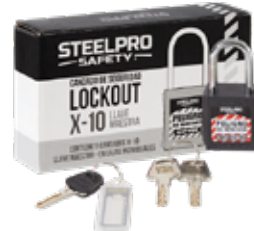
CAJA X SUND LLAVE MAESTRA - CANDADO GRILLETE ACERO/ CUERPO PA