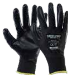
GUANTES POLIESTER NITRILLO