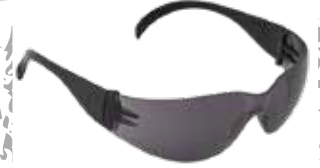
GAFA SPY LENTE GRIS