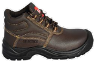
BOTA EN CUERO GRASO MARRÓN FULLRISK 802 ANTIPUNCIÓN