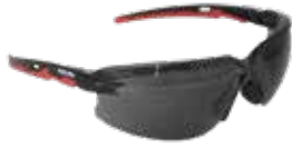
GAFA EPSILON GRIS HYDROPHILIC AF CON CORDÓN