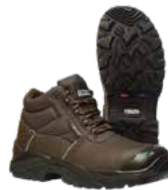
BOTA TRUCKER MARRÓN DIELÉCTRICA