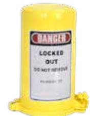
BLOQUEADOR DE VÁLVULA DE CILINDRO DIÁMETRO MÁXIMO 80MM