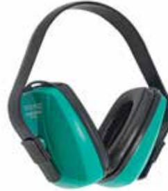
PROTECTOR AUDITIVO COPA GLADIATOR 26DB