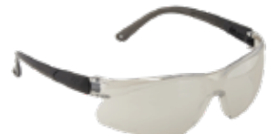
GAFA AERO LENTE IN-OUT ANTI FOG