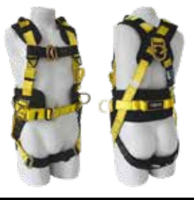
CONFINADOS 6 ARGOLLAS EN H CON MALETA