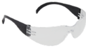
GAFA SPY FLEX LENTE CLARO ANTI FOG