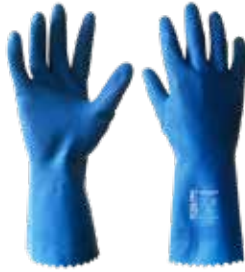
GUANTES ELASTOSAFE NEO AZUL 18MIL 13"