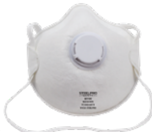
RESPIRADOR M910V N95