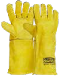
GUANTE SOLDADOR AMARILLO 16