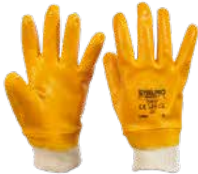
GUANTES NITRILSAFE SUPERVISOR PUÑO TEJIDO