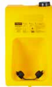
ESTACION PORTATIL LAVAOJOS 60LTS