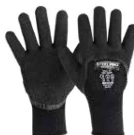
GUANTES WARM NEGRO 3/4 LÁTEX