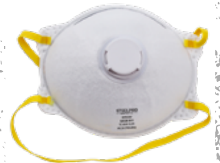
RESPIRADOR M9920V N99