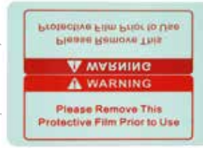
REPUESTO MASCARA SOLDADOR