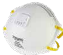
RESPIRADOR M920V N95 VALVULA