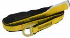
ANCLAJE MOVIL REDLINE 1 ARGOLLA