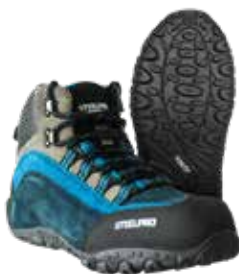
BOTA STEELPRO EAGLE AZUL COMPOSITE DIELÉCTRICA