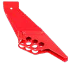
BLOQUEADOR VALVULA DE BOLA 1 PULGADA HASTA 3 PULGADAS