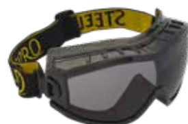
MONOGAFAS EVEREST ANTI FOG GRIS