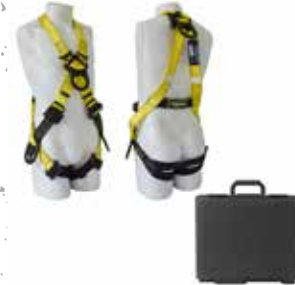
ARNES MULTIPROPOSITO DIELECTRICO 6 ARGOLLAS CON MALETA