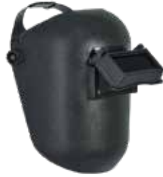
CARETA SOLDAR APOLO VISOR LEVANTABLE