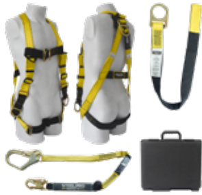
KIT CAIDAS EXPERT ARNES EN H 4 ARG/ESLINGA 1/TIE-OFF 90CM