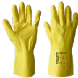
GUANTES ELASTOSAFE NOVA 15MIL 13"