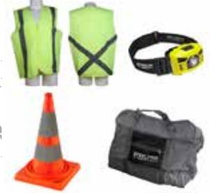
KIT SEÑALIZACION VIAL CHALECO+CONO+SENSOR X+MALETA