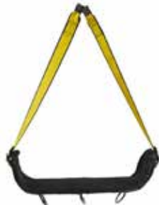
SILLA SUSPENSION ALUMINIO STEELPRO