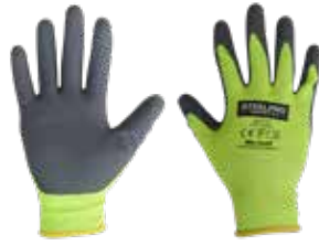
GUANTES MULTIFLEX FOAM NITRILO AMARILLO HV/GRIS