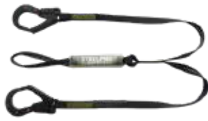
ESLINGA EN Y CON ABSORBEDOR 1,80 M DIELECTRICA 2 1/4 ANC - REATA