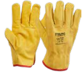
GUANTE VAQUETA SUPERVISOR AMARILLO