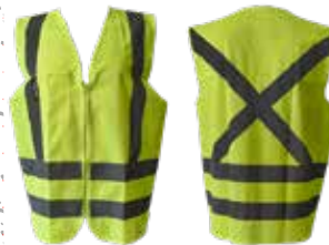
CHALECO POLIESTER VERDE CINTA REFLECTIVO