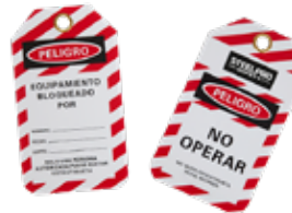
TARJETA PLÁSTICA DE BLOQUEO CON BRIDA Y OJAL METÁLICO ROJO 75X146MM / PQ 10UND