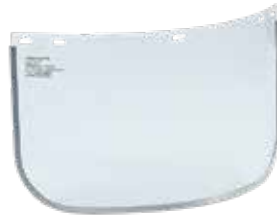
VISOR POLICARBONATO CON RIBETE