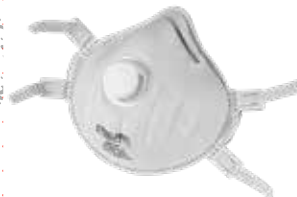
RESPIRADOR SOLDADOR R95 CON VALVULA