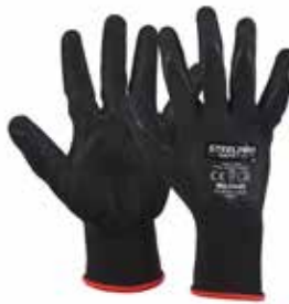
GUANTES MULTIFLEX POLIESTER NITRILO SANDY