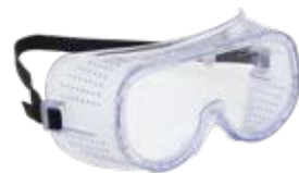
MONOGAFAS WIND VENTILACION DIRECTA AF