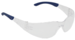
GAFA SPY FLEX LENTE CLARO AF CON CORDÓN