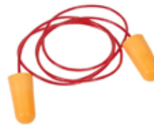
PROTECTOR AUDITIVO DESECHABLE CON CORDON