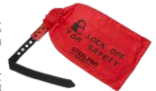
TULA DE BLOQUEO CONTROLES DE MANDO DE MAQUINARIA/ PUENTES GRÚA