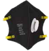
RESPIRADOR PLEGABLE M9910 CON VALVULA N95