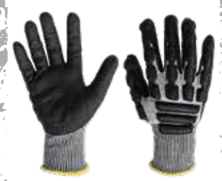
GUANTES CUT IMPACTO NITRILO