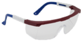
GAFAS TOP GUN LENTE CLARO