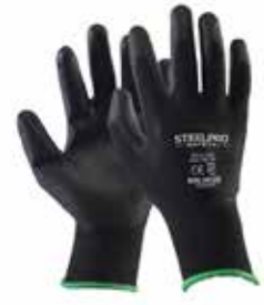
GUANTES MULTIFLEX FOAM NITRILO NEGRO