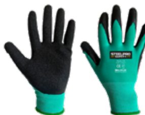
GUANTES MULTIFLEX POLIESTER LATEX VERDE