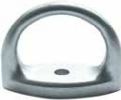
DESCOT PUNTO ANCLAJE ACERO INOXIDABLE 1 PERFORACION