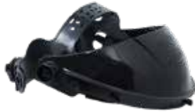
CASQUETE NEGRO AJUSTABLE ROCKET