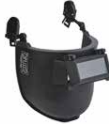
CARETA SOLDAR ADAPTABLE CASCO