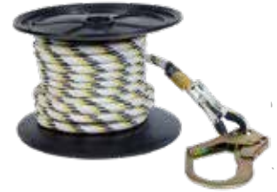
LINEA DE VIDA VERTICAL TEMPORAL EN CUERDA KERNMANTLE 16 MM