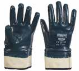
GUANTES NITRIL PUÑO SEGURIDAD NITRITOP