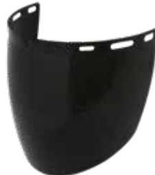
VISOR POLICARBONATO IR 5.0 ROCKET