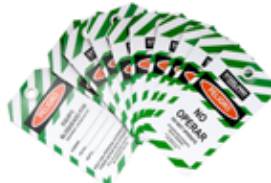
TARJETAS LOTO VERDES X 10 PLÁSTICA - BRIDA/OJAL PLÁSTICO 75X146MM/PQ 10UND