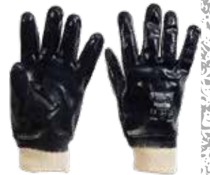
GUANTES NITRIL PUÑO CERRADO NITRITOP LISO