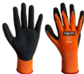
GUANTES MULTIFLEX POLIESTER LATEX NARANJA