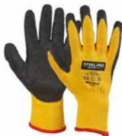
GUANTE MULTIFLEX HILAZA LATEX