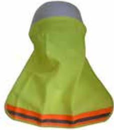
CUBRE CUELLO PROTECCIÓN SOLAR ADAPTABLE A CASCO VERDE NEÓN