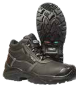
BOTA ANTIEST. NEGRA - TRUCKER