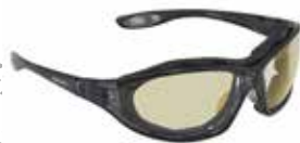
GAFA X5 LENTE ESPEJADO DORADO