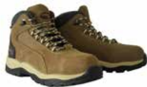
BOTA DIELECTRICA COMPOSITE/ ANTIPERFORACIÓN NAZCA XR-09