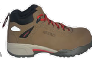
BOTA CUERO NOBUCK EDELBRI60 ANTIPUNCIÓN