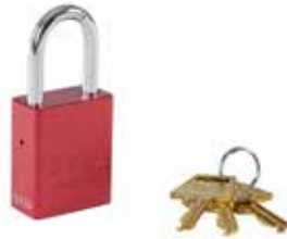
CANDADO LOCK OUT