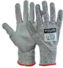
GUANTES MULTIFLEX CUT 5 PU