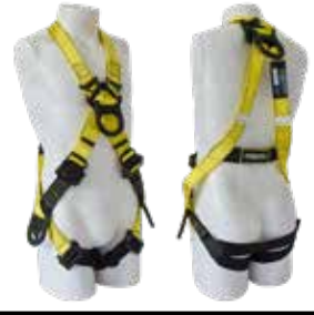
ARNES EN X DIELECTRICO MULTIPROPOSITO SIN FAJA 4 ARGOLLAS