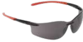
GAFA SPY CITY LENTE GRIS ANTI FOG