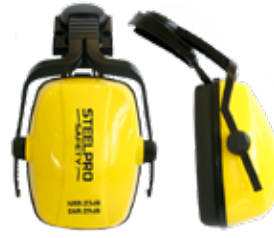
PROTECTOR AUDITIVO ADAPTAR CASCO 24DB CM501