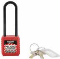
CANDADO GRILLETE LARGO NYLON/CUERPO PA RESISTENTE UV