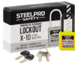
CAJA X SUND LLAVE MAESTRA - CANDADO GRILLETE NYLON/ CUERPO PA