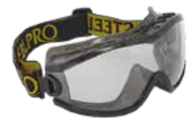
MONOGAFAS EVEREST ANTI FOG CLARO