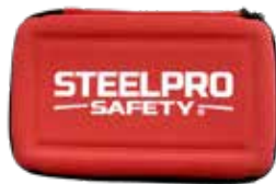
KIT LOTO STEELPRO