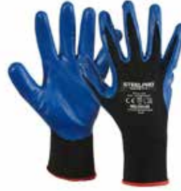
GUANTE MULTIFLEX NYLON NITRILO FOAM AZUL