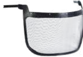
VISOR DE MALLA ADAPTABLE A CASCO O CM501 STEELPRO