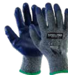
GUANTES MULTIFLEX LATEX ECO GRIS