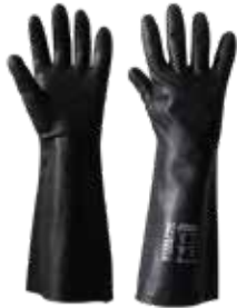
GUANTES ULTRASAFE NEOTHERM 15"