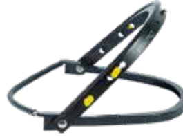
ADAPTADOR PLASTICO VISOR CASCO