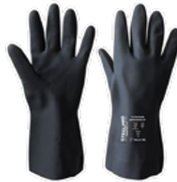
GUANTES ULTRASAFE DEFENDER 13"