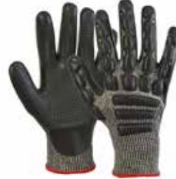
GUANTE CUT-5 IMPACTO PALMA LÁTEX