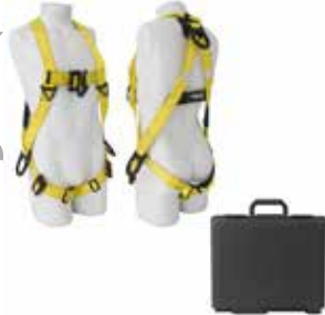
ARNES MULTIPROPOSITO ECO H 4 ARGOLLAS DIELECTRICAS CON MALETA