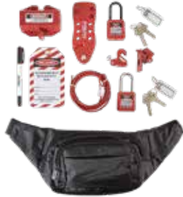
KIT BLOQUEO Y ETIQUETADO PARA ELECTRICISTA