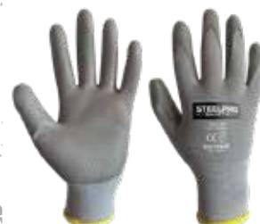
GUANTES MULTIFLEX NYLON PU GRIS/PALMA GRIS