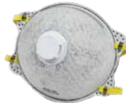
SP RESPIRADOR N95 M920CV CARBON ACTIVADO