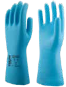
GUANTES NITRILSAFE SOFT 13" 15MIL