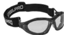
GAFA X5 LENTE CLARO