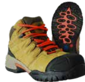
BOTA CUERO NOBUCK EDELBRI80 ANTIPUNCIÓN