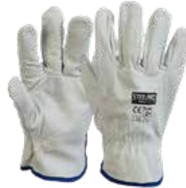
GUANTES VAQUETA SUPERVISOR NATURAL/LARGO DEL PUÑO ESTANDAR