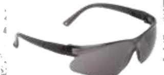
GAFA AERO LENTE GRIS ANTI FOG