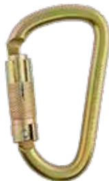
MOSQUETON EN D CARABINERO ACERO DOBLE