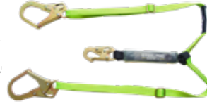
ESLINGA ECO EN Y CON ABSORBEDOR REGULABLE 1,8 M - VERDE