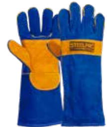
GUANTE SOLDADOR AZUL 14