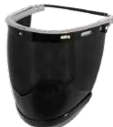
CARETA ROCKET PARA CASCO PROT. BARBILLA ALTAS TEMP IR 5.0 AF