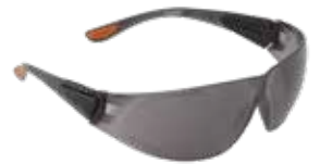
GAFAS RUNNER ANTI FOG LENTE GRIS