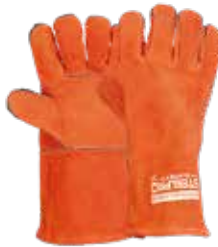
GUANTE SOLDADOR NARANJA