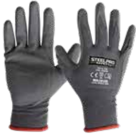
GUANTES MULTIFLEX FOAM NITRILO GRIS/PALMA GRIS