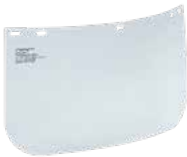
VISOR POLICARBONATO SIN RIBETE