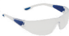
GAFAS RUNNER ANTI FOG LENTE CLARO