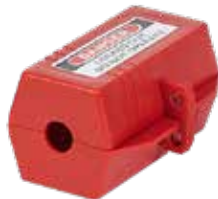
BLOQUEO PARA ENCHUFES ELÉCTRICOS 118X65X65MILIMETROS (CABLE DIÁMETRO DE 20 MILIMETROS)