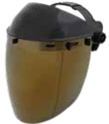
CARETA VISOR POLICARBONATO IR 5.0 ROCKET DORADO