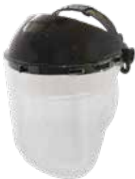
CARETA ROCKET VISOR CLARO AF MENTONERA