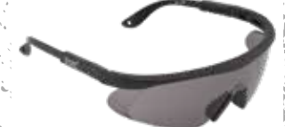
GAFA DEMON LENTE GRIS ANTI FOG