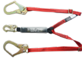
ESLINGA ECO ABSORBEDOR EN Y 2 GANCHOS 2 1/4