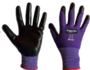
GUANTES MULTIFLEX POLIESTER NITRILLO