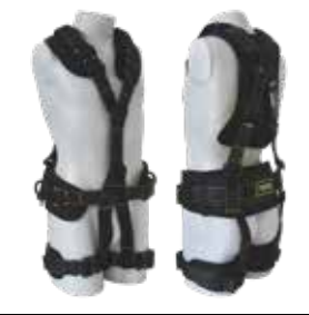
ARNES DE RESCATE 7 ARGOLLAS NEGRO