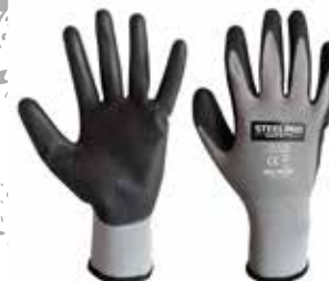
GUANTE MULTIFLEX NYLON PU GRIS /NEGRO