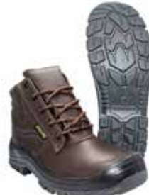
BOTA EN CUERO CAFE PUNTA ACERO WORKER