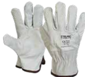
GUANTES CUERO DRIVER BLANCO