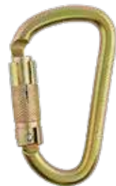
MOSQUETON EN D CARABINER EN ACERO TRIPLE SEGURO 45KN