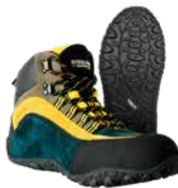
BOTA EAGLE GAMUZA AMARILLA DIELÉCTRICA