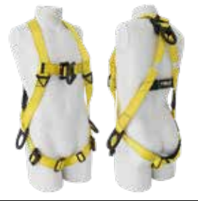
ARNES MULTIPROPOSITO ECO H CON ARGOLLAS DIELECTRICAS