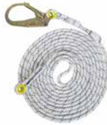
LINEA VIDA VERTICAL CUERDA 10MTS 16MM