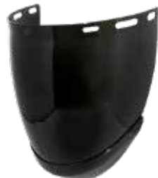
VISOR AF ALTAS TEMPERAT PROT BARBILLA IR 5.0 AF