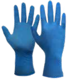
NITRILSAFE EXAMINACION NITRILO AZUL 4MIL CJ X 100