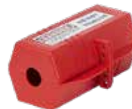
BLOQUEO PARA ENCHUFE ELECTRICO