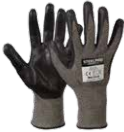
GUANTE MULTIFLEX CUT-5 FOAM NITRILO