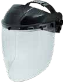
CARETA ROCKET POLICARBONATO AF CLARO