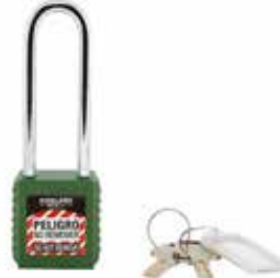
CANDADO GRILLETE LARGO ACERO/CUERPO PA RESISTENTE UV