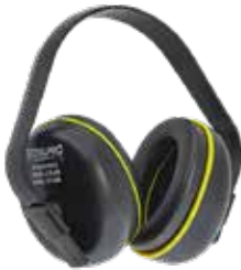
PROTECTOR AUDITIVO COPA SAMURAI 23DB NRR