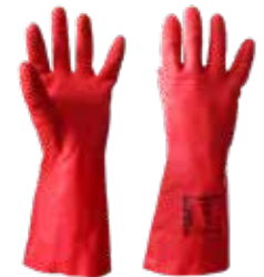
GUANTES ELASTOSAFE FISHERMAN 15MIL