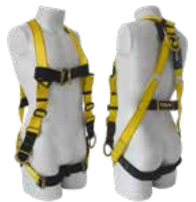
ARNES EN H MULTIPROPOSITO 4 ARGOLLAS EXPERT LINE