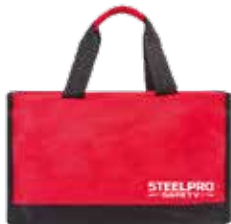
KIT MANTENIMIENTO / CONTRATISTA