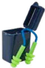
PROTECTOR AUDITIVO PVC REFLEX EP-T06C