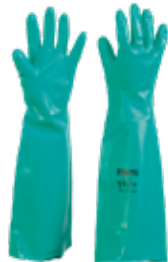
GUANTES NITRILSAFE VERDE 18" 22MIL