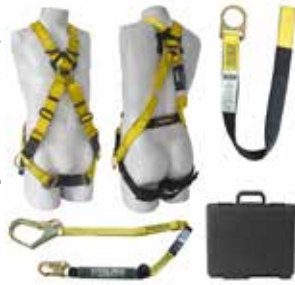
KIT CAIDAS EXPERT ARNES EN X 4 ARG/ESLINGA 1/TIE-OFF 90 CM