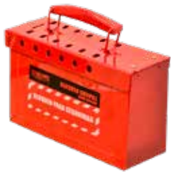
CAJA BLOQUEO 12 A 14 CANDADOS 152X260X103