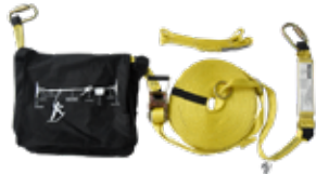
LINEA DE VIDA HORIZONTAL TEMPORAL EN CINTA 20 M