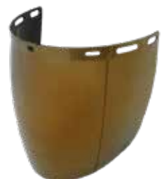
VISOR POLICARBONATO IR 5.0 ROCKET DORADO