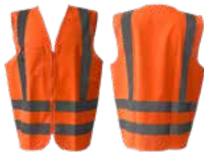
CHALECO POLIESTER NARANJA CINTA REFLECTIVA