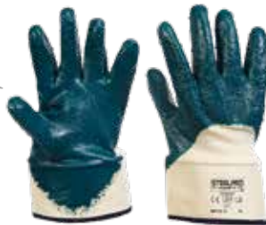
GUANTES NITRILSAFE RUGOSO PUÑO 3/4 MPCB-R