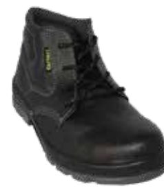
BOTA BRAVO CUERO NEGRO DIELECTRICA