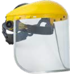
CARETA ESMERILAR RACHET RIBETE