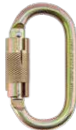
MOSQUETON SIMETRICO EN ACERO DOBLE SEGURO