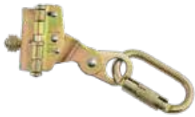
FRENO PARA CUERDA 14MM - 16 MM CON MOSQUETON SIMÉTRICO