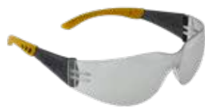
GAFA SPY FLEX LENTE IN-OUT