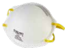
RESPIRADOR M920 N95