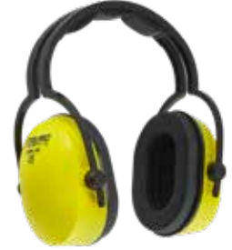
PROTECTOR AUDITIVO COPA CM-502