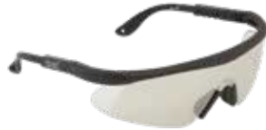
GAFA DEMON ANTI FOG IN-OUT