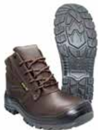
BOTA WORKER MARRÓN DIELÉCTRICA