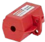
BLOQUEO ENCHUFE ELÉCTRICO MEDIDA: 89X51X51MM