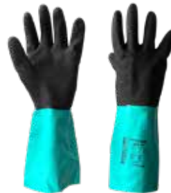
GUANTES NITRILSAFE NEO 13" 15MIL