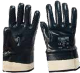
GUANTES NITRILSAFE LISO PUÑO DE SEGURIDAD