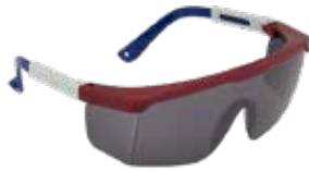
GAFAS TOP GUN LENTE GRIS