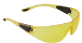
GAFAS RUNNER AF LENTE AMBAR