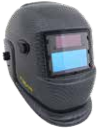
CARETA SOLDAR AUTOMATICA