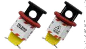
BLOQUEO DE BREAKER ELÉCTRICO PIN EXTERNO >12MM