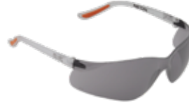
GAFA NEON LENTE GRIS ANTI FOG