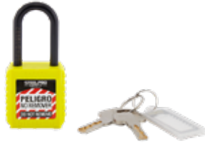
CANDADO GRILLETE NYLON NEGRO/CUERPO PA RESISTENTE UV