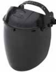
CARETA VISOR POLICARBONATO IR 5.0 ROCKET