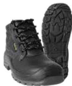
BOTA EN CUERO NEGRA PTA ACERO WORKER