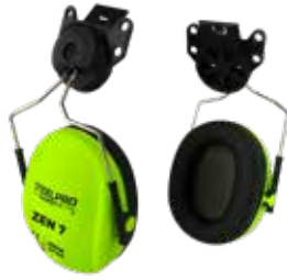
PROTECTOR COPA ADAPTAR A CASCO ZEN7 NRR23DB/ SNR29DB