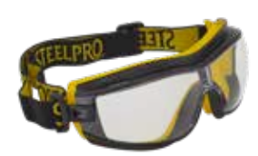
MONOGAFAS ZEX ANTI FOG CLARA