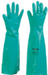
GUANTES NITRILSAFE VERDE 13" - 15 MIL EN