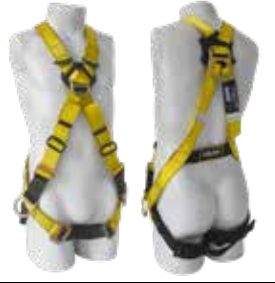
ARNES MULTIPROPOSITO H ALTA VISIBILIDAD