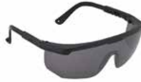
GAFA NITRO LENTE GRIS