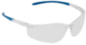
GAFA SPY CITY ANTI FOG