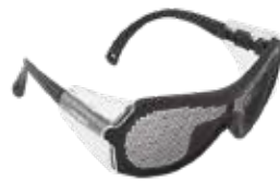
GAFA RIGEL MALLA CON CORDÓN