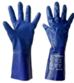
GUANTES NITRILSAFE THERM 13" SOPORTADO