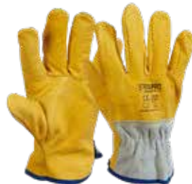
GUANTES CUERO DRIVER AMARILLO