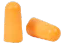
PROTECTOR AUDITIVO DESCARTABLE SIN CORDON